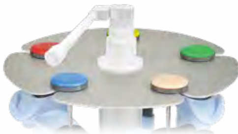
Pipette Stand, with additional alcohol sprayer