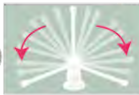
180° spray head