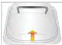
Side opening of the lid to allow minimum evaporation while maintaining water bath temperature.