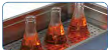
Built-in magnetic stirring mechanism ensures outstanding temperature uniformity