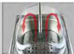
Concave lid design allows condensation flow back to the tank.