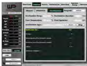
Automatic sterilization process