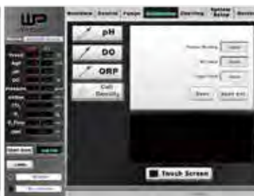
Online system calibration