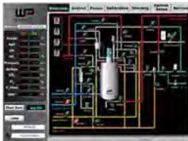
Monitor page for operation overview

- Pneumatic valves for accurate and automatic control - Orbital welding provides top quality