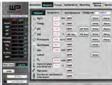
Automatic and manual operation