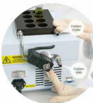
Cooling System Connection Port