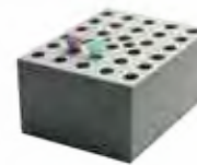
Dry Bath Block, MD series