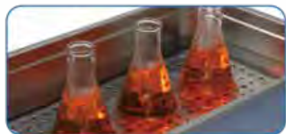
Built-in magnetic stirring mechanism ensures outstanding temperature uniformity