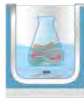
Water circulation function