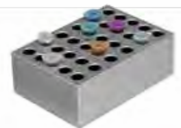
Ultimate Dry Bath Block, MC series