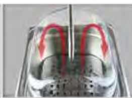
Concave lid design allows condensation flow back to the tank.