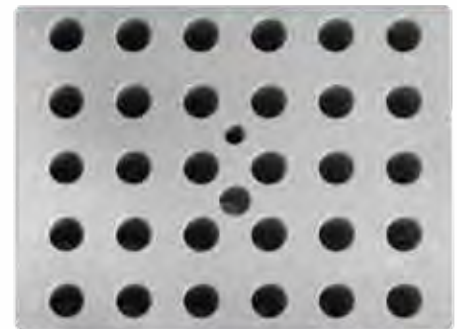
Laser marked on the selected blocks