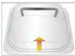
Side opening of the lid to allow minimum evaporation while maintaining water bath temperature.